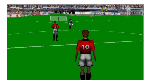
(a) soccer game

The soccer player agents each have a simple cognitive loop based on the extended BDI model described in [6], which may be summarized as sense , think , act . <sup>8</sup>